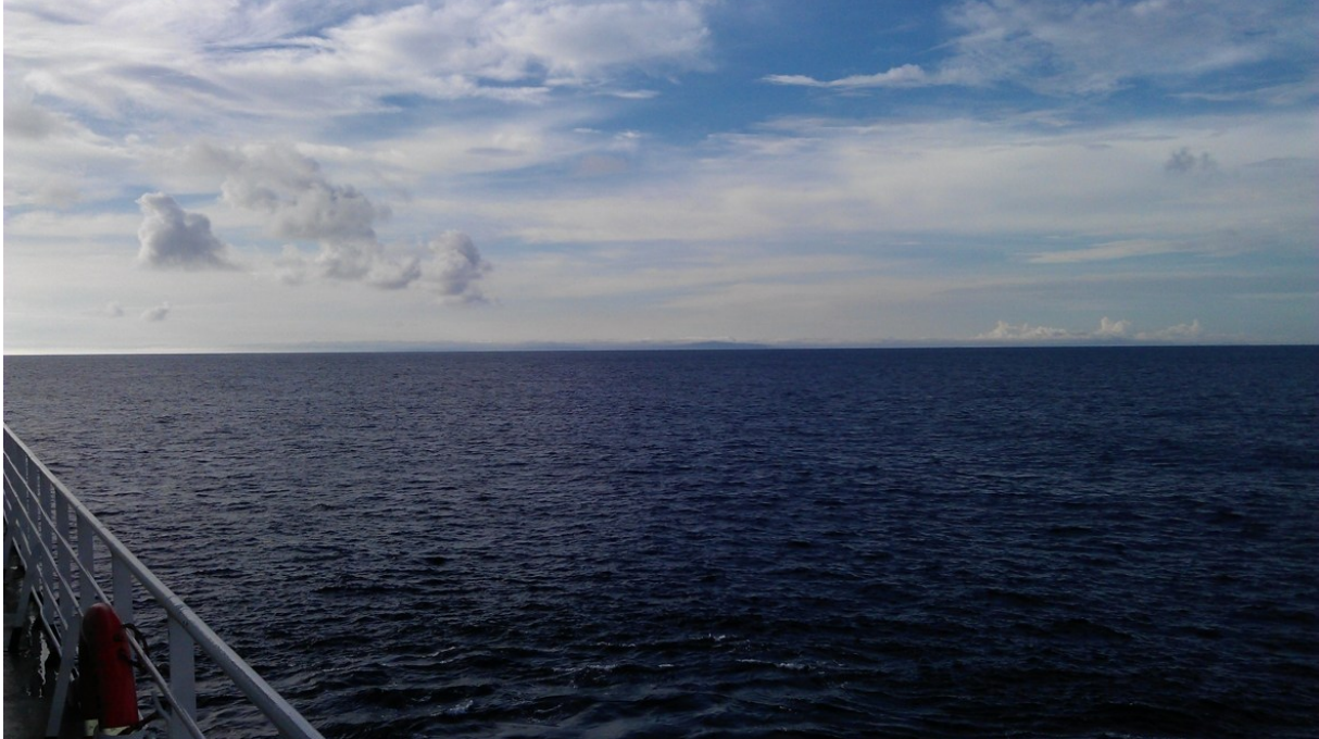
On the horizon one can just see the northern shores of Colombia

Our cruise track took us very close to the Dutch Antilles; we saw the light house of Curaçao in the dark and now and then we get a glimpse of Colombia. During the last few weeks the horizon was mostly empty of life in all directions. Now it is clear that we are approaching the civilized world again by the amount of passing ships. Other signs of getting close to land again are the large amount of gannets that plummet into the water to catch (flying) fish.