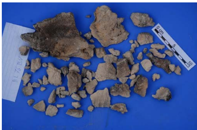
Figure 2. Authigenic carbonates recovered from the top of a diapiric ridge next to the Medee Brine Basin.

For the first time in the area we found authigenic carbonates in the close vicinity of a brine (Figure 2). Plenty of gypsum crystals with different crystal structure were recovered from brine-floor sediments. Astonishing finding of diverse chemosynthetic organisms confirmed that indeed hypersaline (in some cases alkaline) environments of the Ionian brines are somehow suitable for so far poorly understood life.