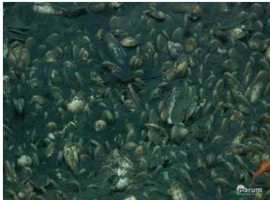
Picture 5 and 6: The dense Vesicomyid clam beds of the southwestern REGAB pockmark. Left: respiration measurements with benthic chambers. Right: Close up of living clams dwelling the sediments for sulfide.

Further details of our daily work and the scientists on board can be found on the expedition BLOG hosted by www.planeterde.de.