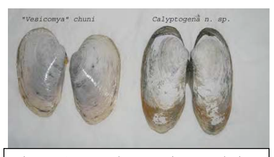
Picture 4: New clam species populating the reduced pockmark sediments

Luckily, the dive 225 made up for all the extra effort. It was the first dive during the cruise, which lasted for 16 hours bottom time, and allowed for retrieval of samples, in situ measurements and interesting video footage for all scientists on board. The goal of dive 225 was to explore and sample a new site with clam beds (bivalves of family Vesicomyidae) in the Southwestern part of the REGAB pockmark (Picture 4). This site was previously described as the largest clam field of the REGAB pockmark, during its first exploration by the ROV VICTOR in 2001. Most interestingly, two different species of chemosynthetic