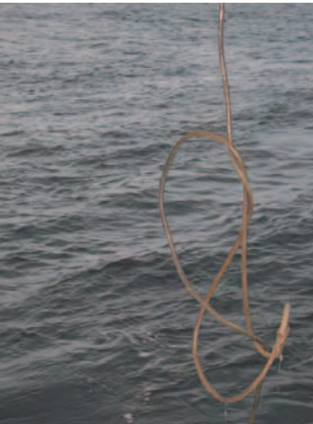
Picture 1: ROV cable "salad" – unfortunately a common view during M76/3b

sensitive cable. Luckily and thanks to the excellent support by the deck and bridge crew, the recovery went smooth and without problems. In less than an hour after recovery, the ROV team was able to locate the error: In the last 20 cm of the cable, close to the connection to the ROV, the fiber which transports all data - including those controlling the vehicle - showed a disconnection.