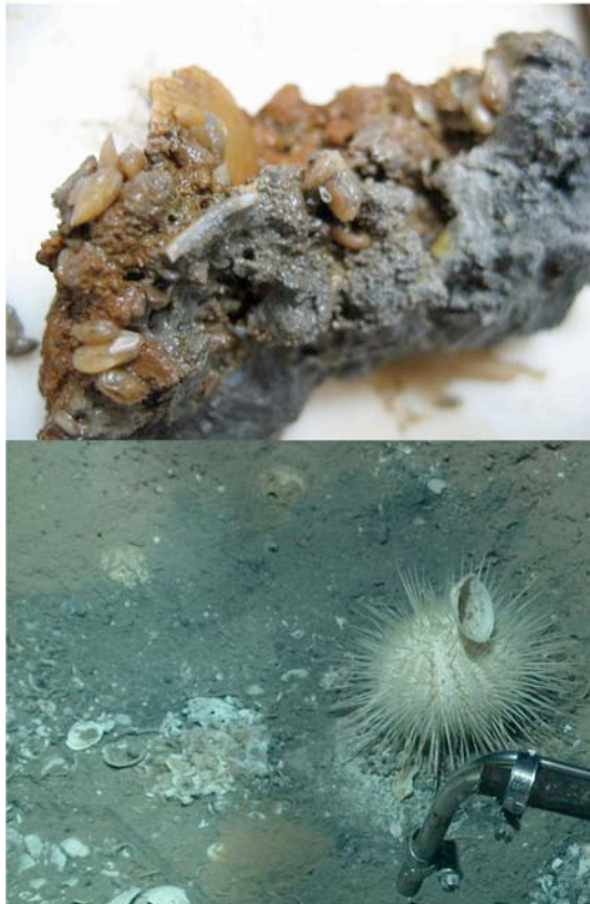
Fig. 1 Animals and crusts of the Amon seeps

At first sight, the deep sea of the Eastern Mediterranean looks quite poor in life, even at its cold seep systems, but the diversity is in the detail. The carbonate crusts surrounding the sulfidic sediments of Amon are populated by many different animals: gastropods, anemones, polychaetes, sipunculians, small sponges, and also by chemosynthetic bivalves. Sampling of a few crusts provided 24 small mussels ( Idas sp) (Fig. 1a) and 6 lucinids ( Lucinoma aff. kazani ), both most likely hosting sulfide-dependent symbionts. Interestingly, half of the mussels and one lucinid harboured small white worms (up to 2 cm long, very thin), most likely a parasite. We also collected a beautiful sea urchin (Fig. 1b) named “Benedicte” after an excellent new HERMES student working day and night with smelly muds and crumbly crusts. Furthermore, our biologists were very pleased when a giant shrimp was recovered alive from one of the gravity cores taken at Amon. We suspect that this critter is the cause of zillions of biogenic mounds covering hundreds of square meters around the active center