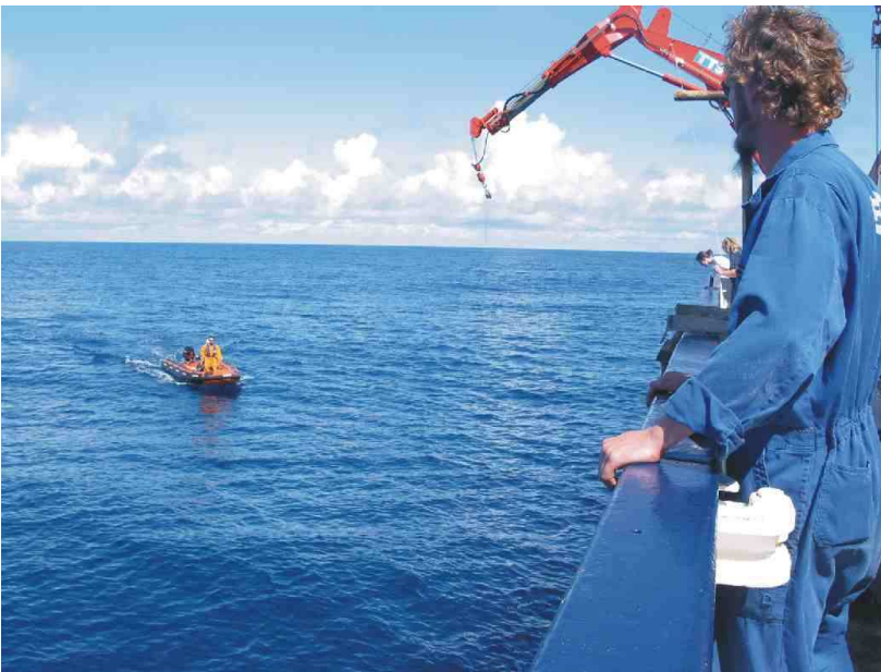
Figure 5: Warm and calm seas in the Canary Basin.

We also took the opportunity of the long transit at the beginning of the week to hold our 'Bergfest'. This included the cultural highlight of the cruise with the awarding of prizes for the Meteor 60-5 photo contest. Twenty excellent entries were submitted in the categories: 'Science', 'Life on Board', and 'Art: