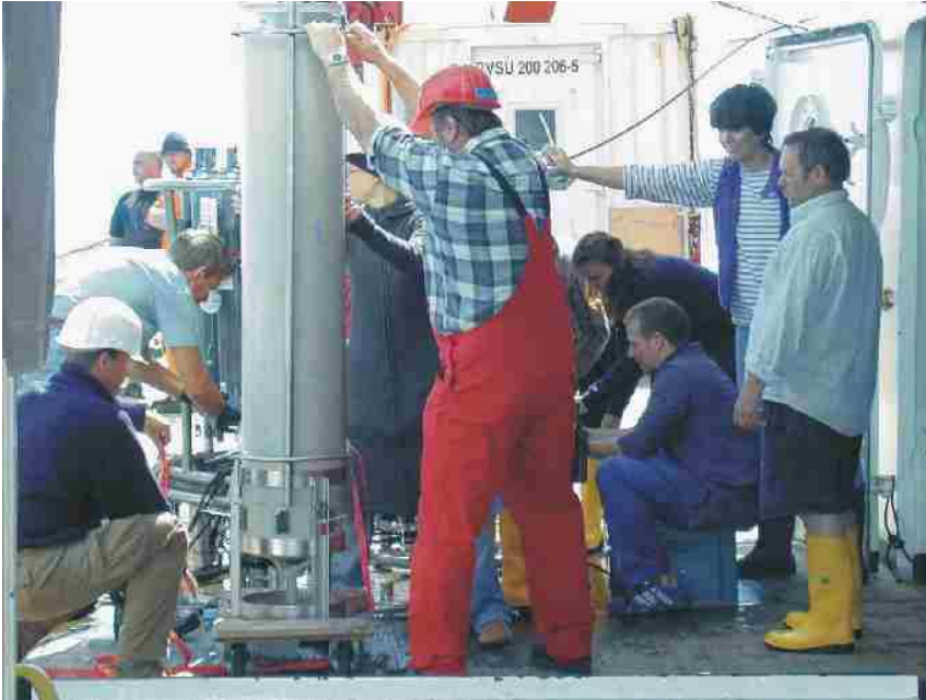
Figure 0: Preparing the Snowcatcher

During the 2 nd week, we benefited from the route-planning assistance provided by the Bordwetterwarte of the Deutscher Wetterdienst. In particular, we were able to 'snatch' an extra, northern TTO station out of the jaws of two storm depressions thanks to insight into model predictions from our meteorologist.