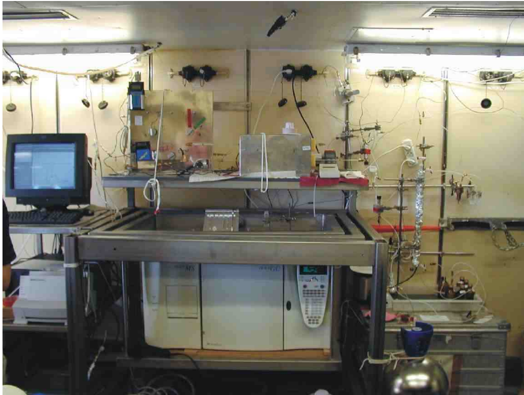
Figure 6: Gas-chromatograph/Mass spectrometer system in the GeoLabor.

northwards transect, to the east of the Azores, and started the final transect eastwards towards Lisbon along 37°N, following the path of TTO Leg 4 (Chief Scientists: Wally Broecker and Claes Rooth).