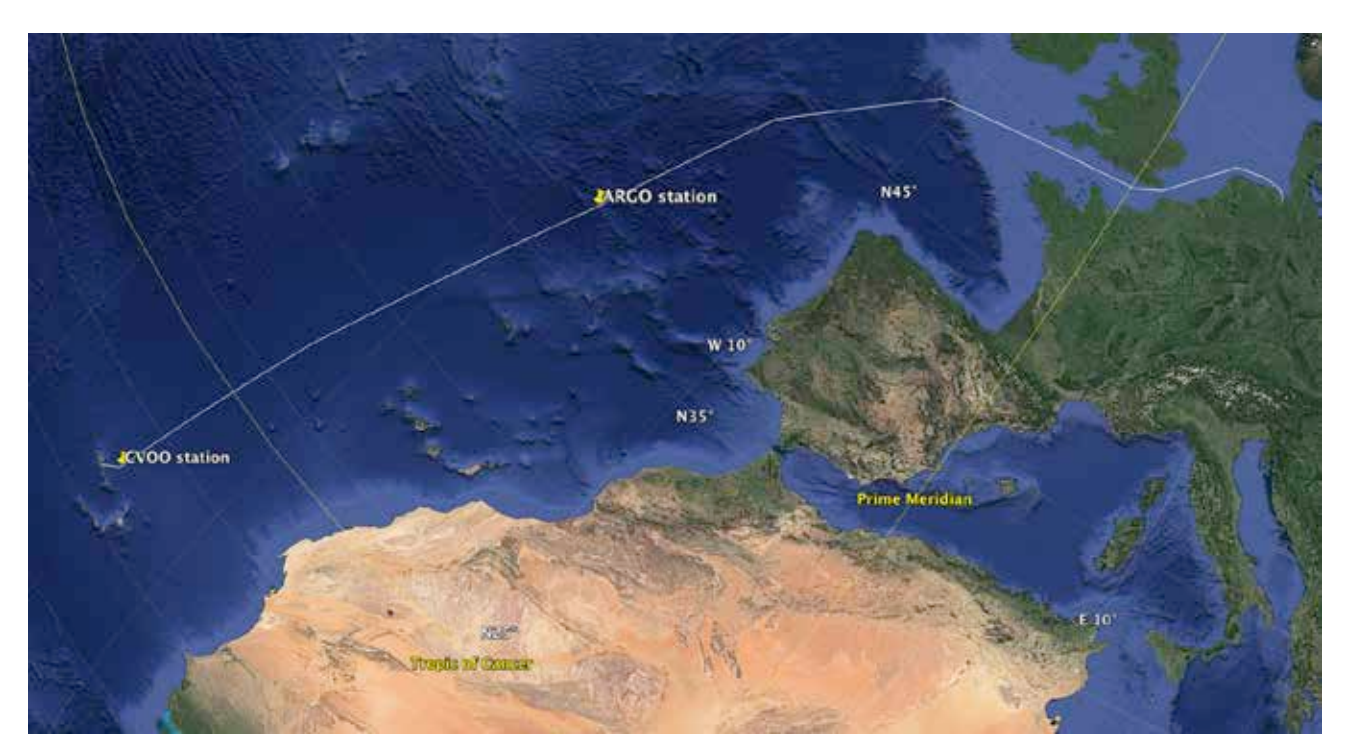
Fig. 1: Cruise track and stations of research expedition MSM 68/2 (Map: Google Earth)