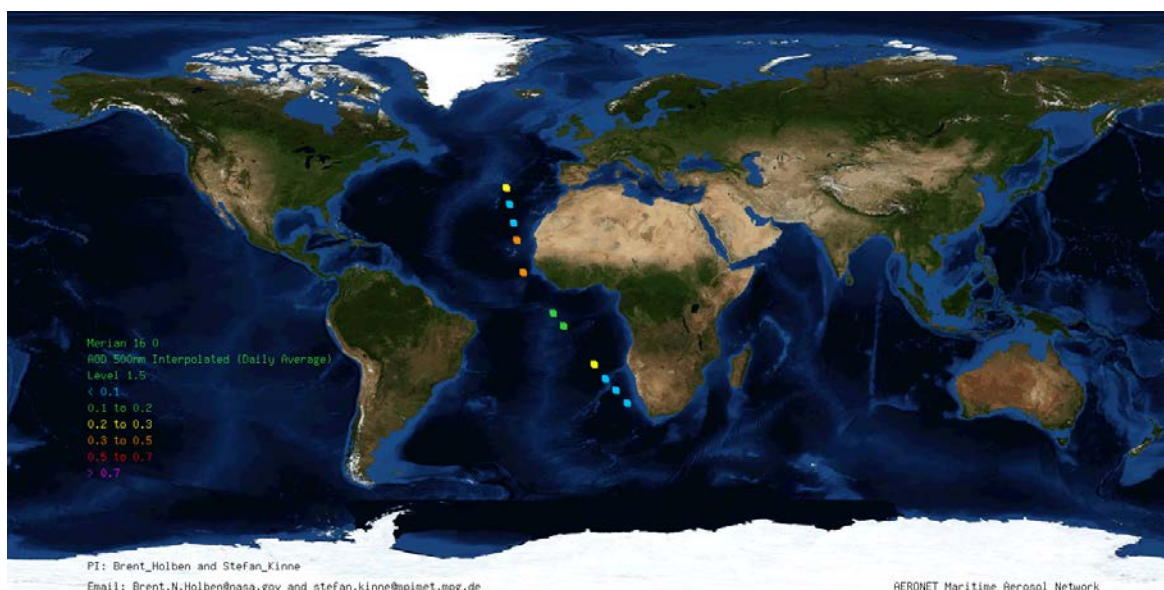
Figure 1: MICROTOPS measurements on the cruise MSM58/2 ( http://aeronet.gsfc.nasa.gov/new_web/MAPS/Merian_16_0_500_Daily_Average_15.gif ).

During the entire cruise, the weather conditions were good for the measurements with mostly moderate relative wind from the front. The MIRCOTOPS instrument needed an unobstructed view of the sun. Due to this fact, it was not possible to take measurements on four days of this cruise due to cloudiness. The MAX-DOAS measurements are not influenced by clouds, but a relative wind from the front is needed, because otherwise the measurements might be contaminated by the plume of the vessel.