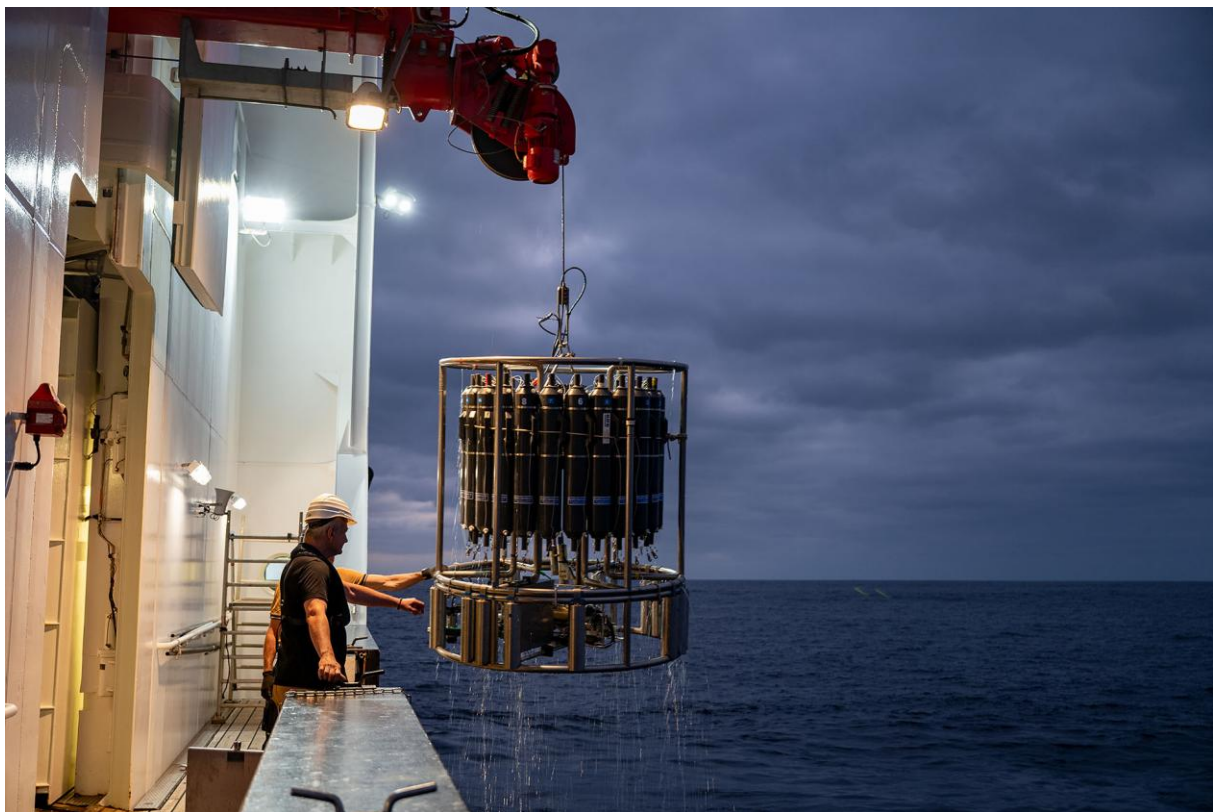
CTD probe with rosette sampler being heaved on deck after successful deployment.