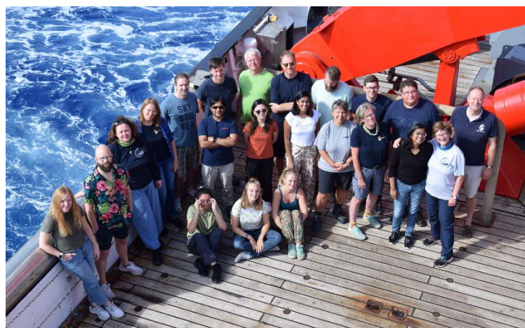
Scientists of cruise SO300/1.