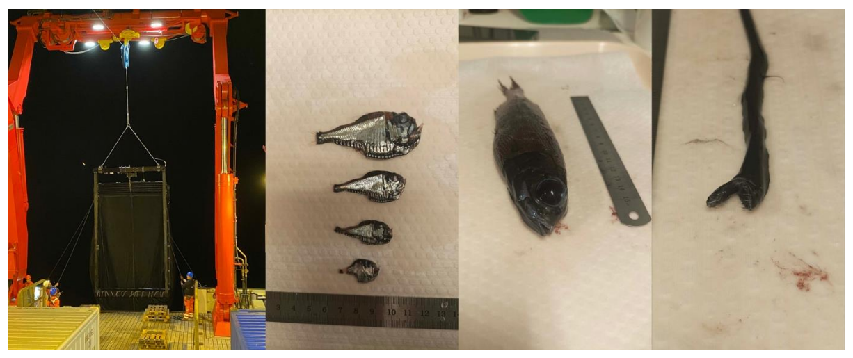
Fig.5: Deployment of the large MOCNESS net during night and some examples of the deep sea fish caught.