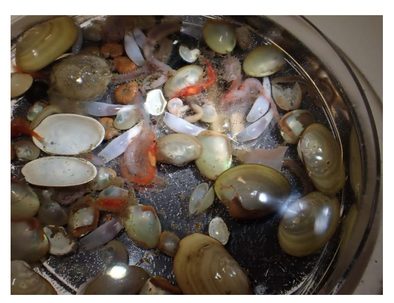
Fig.6: Benthic organisms from the sediment of the deep station 39 with oxygen rich-bottom water.

Later on Sunday (22.01.2023), the MOCNESS-net will be deployed once again at the deep Station 39 during daylight hours to record the migrations of deep-sea fish. This will be followed by a larger deployment of the CTD to collect water samples so that all working groups are supplied with samples before we start a detailed investigation of the oceanographic situation on the shelf with the microstructure probe in the following 24 hours.