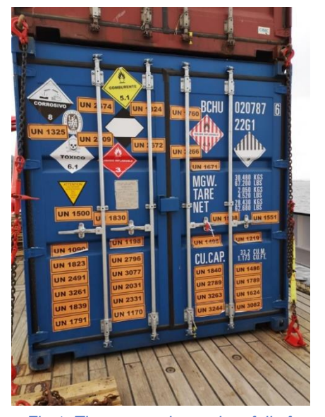
Fig.1: The punctual container full of stickers.

On 19.1. and 20.1.2023 a mixed team of 22 scientists from the Leibniz Institute for Baltic Sea Research, Warnemünde (IOW), one scientist from ICBM (Oldenburg), 15 scientists from the University of Concepción and 1 scientist from CU in Boulder (USA) came on board and started to settle in. Unfortunately, 4 of 5 containers from Germany were still missing at that time. In addition, the one punctual container surprised us with a colorful mixture of stickers, which it had apparently collected during its transport (Fig.1).