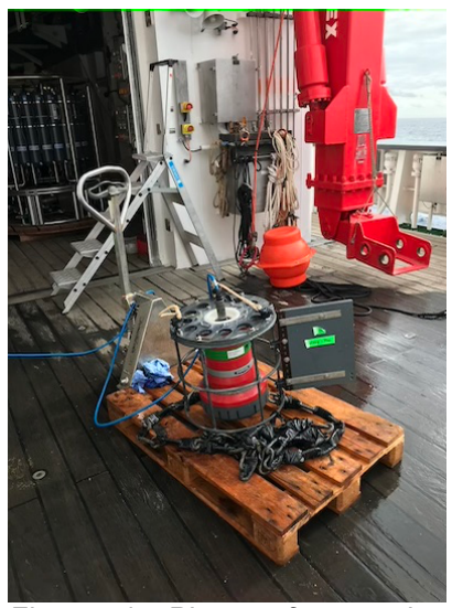
Figure 4: Photo of acoustic modem for acoustically connecting to the pressure sensors.

After retrieving the heel devices and acoustic modem, the air pulsers were installed again (19/03, 16:00). A complete north-south refraction profile will be taken the following night, after which recovery of 33 of the experiment's OBS instruments will begin.