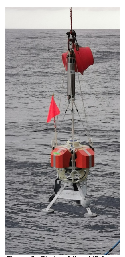
Figure 3: Photo of the drift-free pressure sensor during installation on the deep-sea wire.

13:07 am, it had arrived at 1785 m water depth, standing horizontally as planned with an angle of incidence of two degrees. An upload of the data from the device on the seabed showed that the pressure sensor was working as desired.