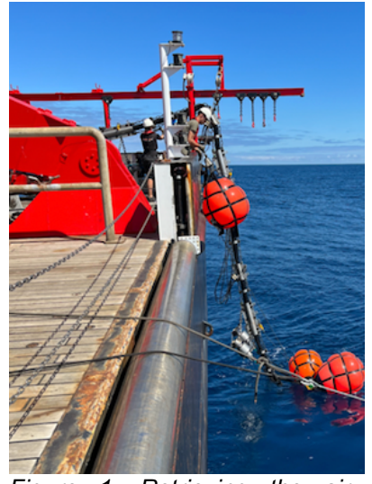
Figure 1: Retrieving the air pulsers and floats on the starboard side.

strong earthquakes mainly occurs near the trench, this drift-free measurement allows for the first time to resolve long-term vertical deformation, contributing to knowledge on stress build-up in the marine forearc. At the same time, the pressure readings also reflect sea level changes, which the system also records. During the SO297 cruise, three absolute pressure sensors from IMO (Instituto Milenio de Ocenografía, Chile) and two pressure sensors from GEOMAR will be installed.