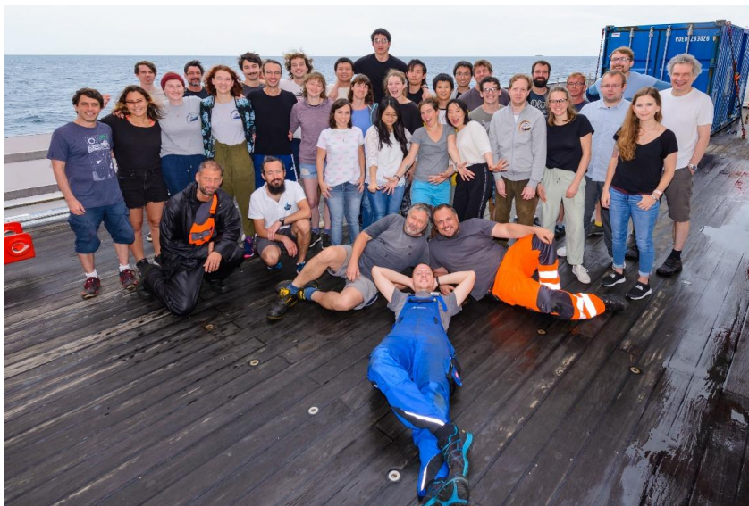
Fig. 1: Scientists and crew of SO289.

Progress: Our last station (station 44) was conducted in the early morning of April 4. Immediately after the station was finished, we departed for Noumea, and started analysing the last set of samples, clearing our laboratories and packing our boxes and loading the containers. The packing of our samples and equipment had to be done rapidly as a tropical cyclone was approaching New Caledonia and we had to enter port early. We therefore efficiently