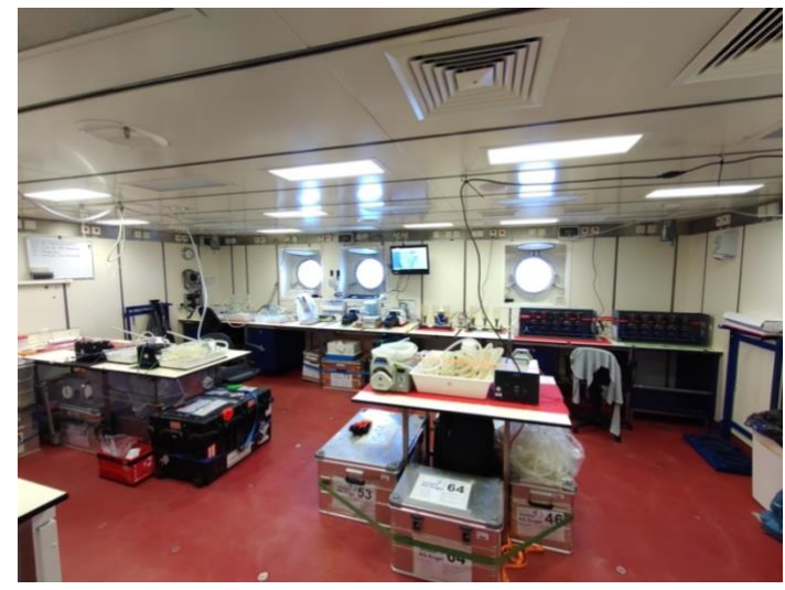
Fig. 2: Installation of the biochemical lab.