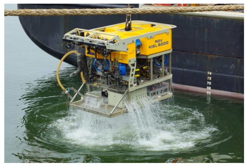
Fig. 3: Test dive of the remotely operated vehicle ROV Kiel 6000 carried out in the port of Guayaquil (CONTECTON-terminal, mooring 6). The ROV will be used to recover the GeoSEA Array during cruise SO288.

On Saturday the 15. of January 2022 at around 13:00h, the RV SONNE left the CONTECTON-Terminal of Guayaquil port in Ecuador (02°16'S/79°54'W). The port was left after the result of an extensive PCR-screening, which took place the previous day, came back all negative. Further PCR screening is scheduled to take place after a few days at sea. The incipient journey follows the south American coastline down to our study area offshore northern Chile. A first safety briefing was already carried out during the passage of the Rio Guayas.