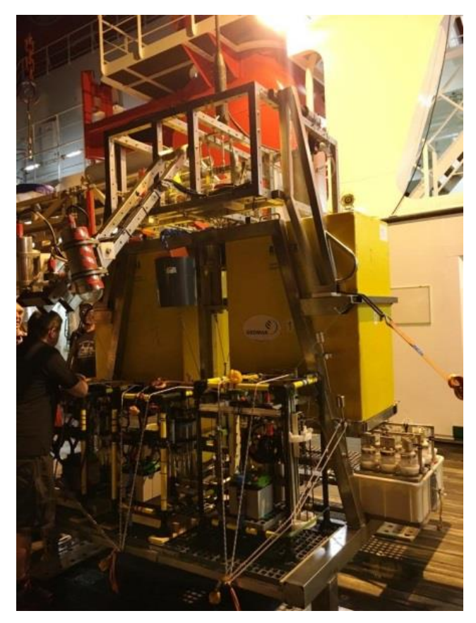
Right: Elevator-Lander with launcher on top.

Now both elevator landers equipped with modules for in situ measurements and experiments were deployed video-guided by a launcher in the immediate surrounding of the 1<sup>st</sup> ROV dive.