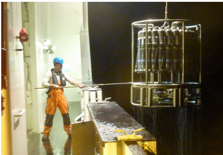
Retrieving the CTD probe at night time.

During the second week of the R/V SONNE cruise SO265 everyone on board became accustomed to the constant alternation between searching for new sampling sites (i.e. mapping of the seafloor) and sampling (dredging). Furthermore, the sample preparation in the labs became routine.