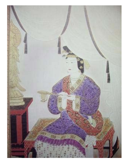
Empress Suiko (554–628 years AD), third and youngest daughter of Emperor Kinmeia and his wife Soga

The Suiko volcano is located at about 45° north and 170° east and is within the area of the Subarctic Front, which is defined as the 4°C isotherm in 100 m water depth and the approximate boundary between the wind-driven subtropical and subarctic vortex systems. The volcano is interesting in the sense that we continue to hope to be able to recover good sediments on the summit areas located in relatively shallow water. In fact, we are not the first to do geological studies here. The drill ship "Glomar Challenger" already carried out a drilling campaign here in the late seventies with the intention to study the volcanic development of the Emperor seamount chain. In 2001, the French research vessel "Marion Dufresne" retrieved a first paleoceanographically interesting sediment core of ~44 m core length, which had not been worked on until now.