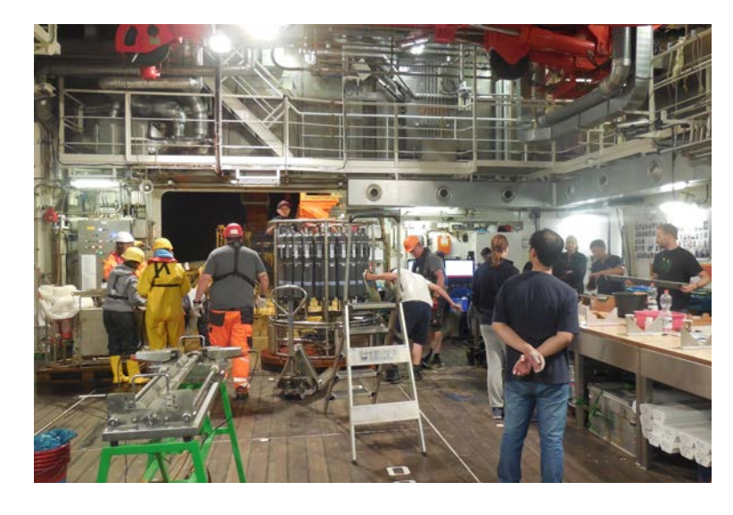
High activity in the geology laboratory. Geologists and biologists work hand in hand on the night station and share the laboratory space.

Apart from sediment coring, a major focus of our work during the last week was bathymetric mapping and profiling with the sediment echosounder. We have significantly expanded this work at Suiko to optimize the difficult search for suitable coring stations. Our work on the previously sampled volcanoes had shown that a systematic recording of the very complex bathymetric conditions and the documentation of existing sediment packages makes the selection of potential core locations much more successful.