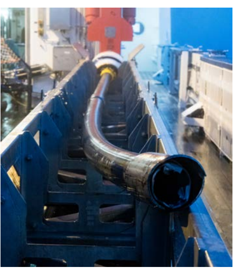
The so-called "bananas", gravity cores which bent or partly broke when hitting the seabed, are rare so far, but then make the deck crew very busy. Fortunately, these "bananas" still contain short high-quality sediment sequences.

The sediment cores, some of which are more than 19 m long, are being extensively analyzed on board before they are sent home packed in reefer containers. After sawing the sediment core into pieces of 1 meter, the exact labeling and the division of the sediment cores into work and archive halves continues. Then, the core segments are first logged by various methods, that is: every centimeter geophysical parameters of the sediment are measured, which help determine the characteristics of the sediments, correlate sediment cores from different areas, and get initial ideas on the age of the sediments. Subsequently, the core segments are photographed and described by experienced geologists. Working and measuring in a large number of on-board laboratories requires many hours and above all, a well-coordinated team working hand in hand. This also presupposes that route planning and station planning is carried out in a forward-looking manner in order to be able to use ship, crew and the scientific group effectively.