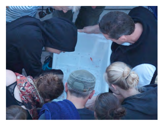
Biologists and geologists have a first look at the outcome of the first trawl.

On June 10th, two more trawls were carried out approximately 500 nautical miles (nm) off the west coast of Australia. To avoid previous problems, the net was deployed open this time and was initially lowered to 700 m depth and then raised in steps of 50 m every 30 minutes. After 3 to 5 hours the net was recovered on deck. Both catches were highly successful and yielded different and rare species of fish, squid, octopus and shrimp. The last trawl was brought in after sunset, avoiding bleaching of the fish and shrimp eyes in order to allow biochemical and physiological experiments on the visual systems. In addition, samples from many different species were collected and preserved for molecular-biological, and morphological work in the respective home labs.