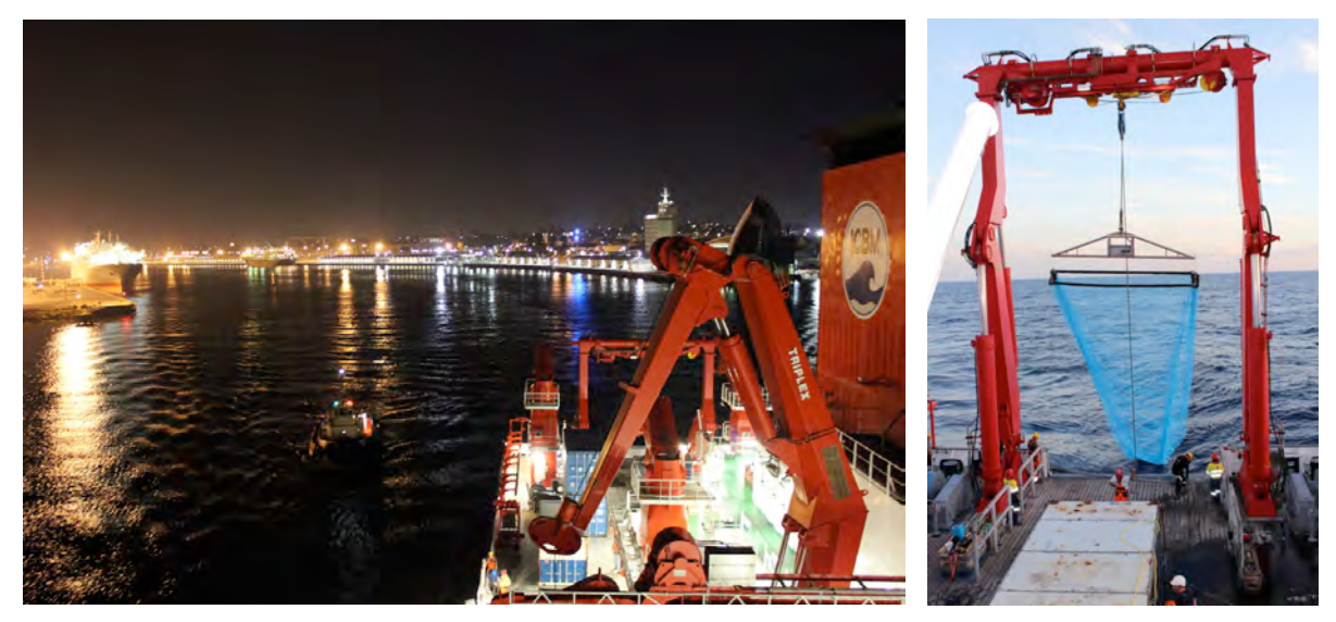
R/V SONNE leaving the port of Fremantle on the evening of June 7th.

Cruise SO258/1 started in Fremantle, close to Perth, which is located at the southwest coast of Australia. On June 5th, in the course of an Open Ship the citizens of Perth and Fremantle had the opportunity to visit the SONNE and get an insight into current research. The vessel, as well as the presentations of the different scientific working groups, met very good response among the 3.200 (!) visitors and Australian media.