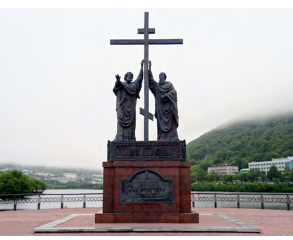
The town Petropavlovsk was named after the two ships of Vitus Bering, namely the 'St. Peter' and the 'St. Paul'. The monument pictures the two saints.