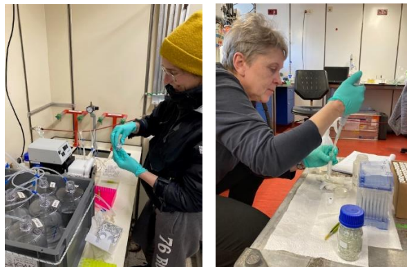
Left: filtration of nitrogen fixation experiment in the cold room of RV METEOR. Right: preservation of samples from the pump CTD

Other bacteria that live in water depths below the light-flooded zone and can also fix nitrogen have hardly been studied. Although their occurrence has been described, little is known about their overall activity. On the M200 cruise, we are therefore taking samples from the anoxic water column and measuring their fixation rates by adding stable isotopes of nitrogen. After incubation, the samples are filtered (see Photo below).