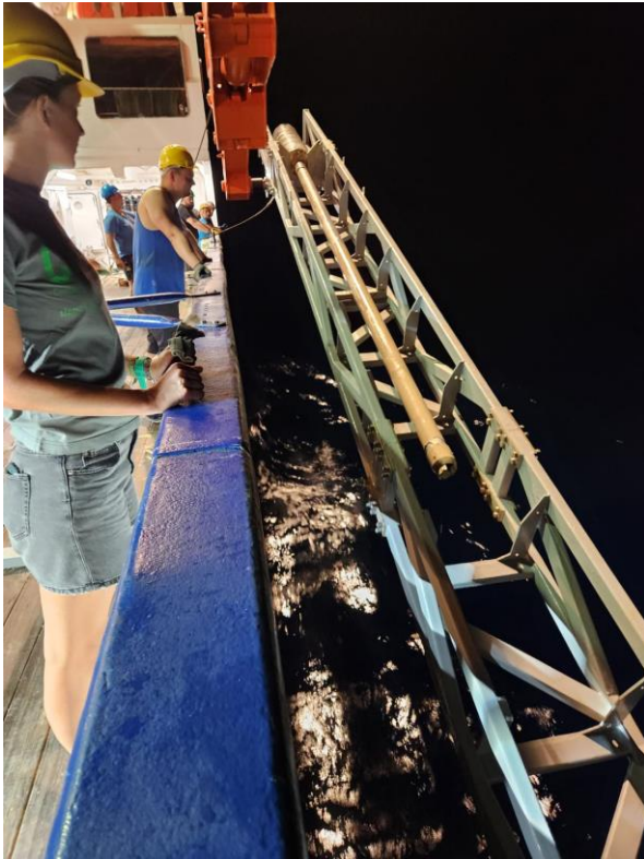
Figure 2: Deployment of a gravity core with the landing rack of the FS Meteor. (Photo: V. Vahrenkamp).

tained at water depths ranging from 960 to 1180 meters. Seafloor sampling focused on the record of planktic organisms, particularly planktic foraminifera and pteropods, as well as the