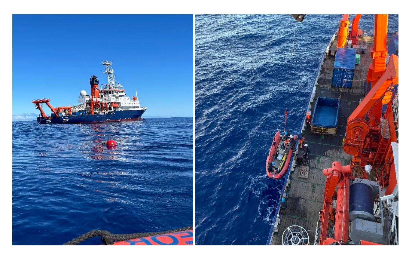
Fig. 2: Deployment of a surface drifter (left) and recovery a glider (right), both in ideal weather conditions from an inflatable boat (photos: L. Aschenbeck).

On early Wednesday morning, after a longer transit, we arrived at the position for recovery of the two gliders that had been deployed on March 25. The day first started with a time series station of microstructure measurements near the surface to observe the diurnal variation of turbulence in and below the surface mixed layer. The two gliders were then recovered easily in the afternoon and the microstructure time series was then continued into the late evening. Both gliders performed well and measured throughout their missions.