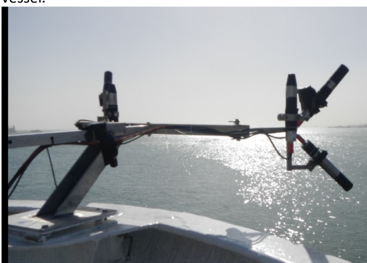
Fig. 3: Radiometers measuring optical properties of the ocean at the front of the RV METEOR.

replicate those made by sensors on earth-orbiting satellites recording ocean colour. By collecting samples at sea alongside the shipboard radiometry measurements, this will allow us to better understand what information the satellites are providing. Ultimately, we hope to be able to use these signals to tell us which types of phytoplankton are living in different regions of the ocean and also provide information about their physiological status (health). Via satellite observations, these data would then be available at much larger spatial and temporal scales than we can cover on a research vessel.