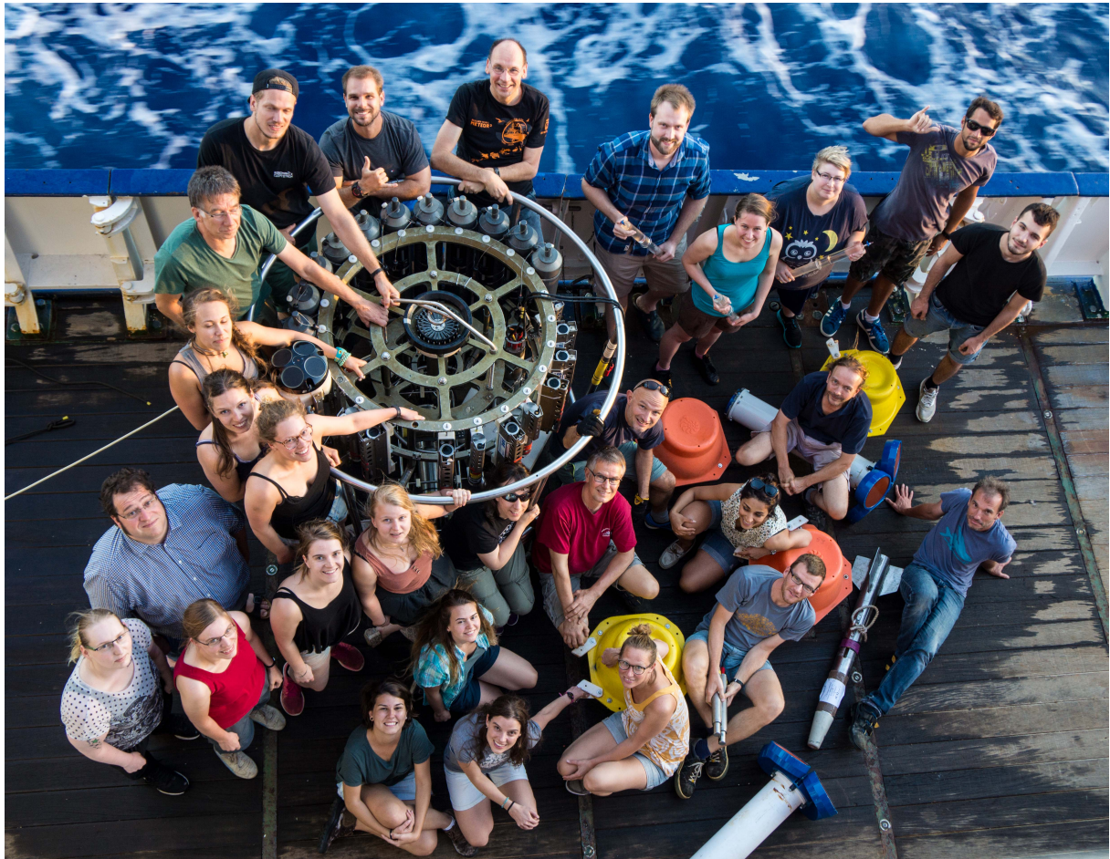
Fig. 2: Group picture of the scientific cruise participants of M145.