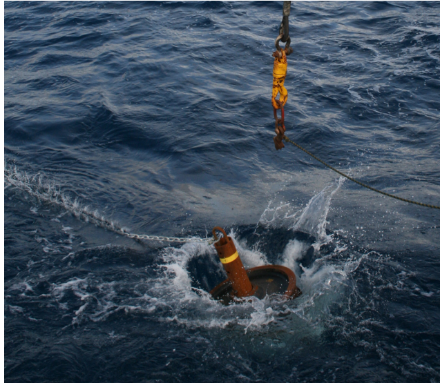
Fig. 1: Anchor drop at the end of the mooring deployment of our equatorial mooring at 23°W.