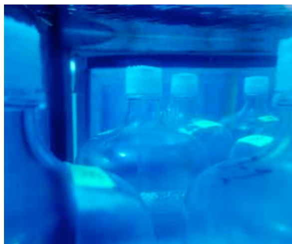
Sample bottles in the incubator at the back of the ship cool the samples and expose them to the blue light of the deeper ocean.

To understand those processes water samples are drawn at depths between 10 and 1000m and the particles are filtered out of the water. Some of the water samples are enriched with isotopic signals and incubated for 24 hours at the back of the ship and afterwards also filtered. Where those isotopes end up and in which molecular form are some of the scientific questions we would like to answer. High-end