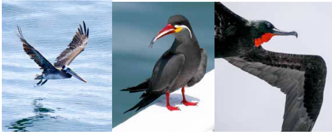
Different kind of birds visit us on ship and provide some entertainment.

chromatographic analysis methods will be used to analyze the data and hopefully provide new insights. Both the isotopic studies and the particles within the plain sea water will allow us to determine the factors that control the uptake of ammonia in the OMZ regime.