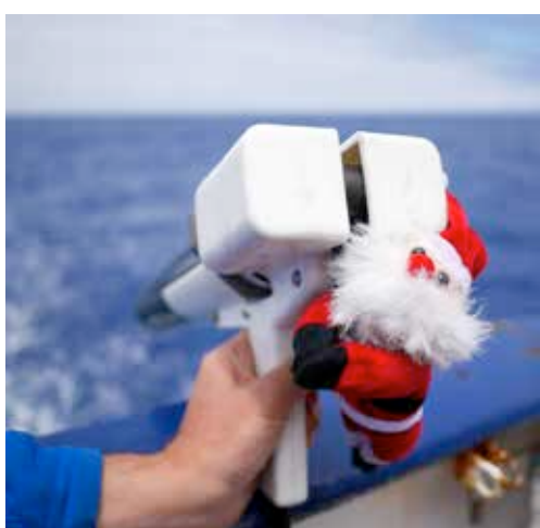
XBT Launcher on METEOR.

South Atlantic with better precision. In addition we are interested to quantify the northward transport of salty surface waters.