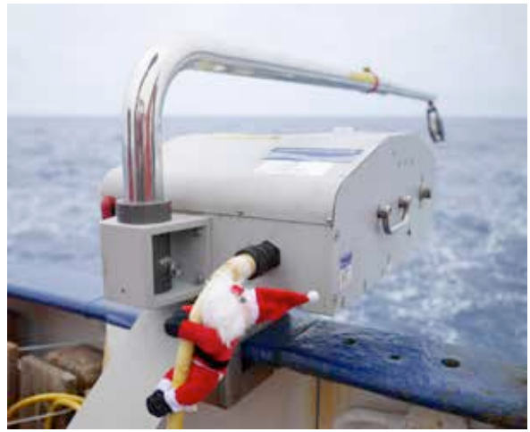
Winch of U-CTD at the stern of METEOR.

Every hour a 400 m deep temperature und salinity profile is recorded by the underway-CTD system. Every other hour an 800m deep XBT profile is complimenting the U-CTD data. These data allow us to quantify the upper ocean warming of the