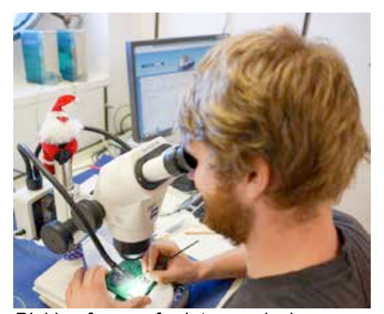
Picking forams for later analysis

Every other day we have deployed the plankton nets. The data show very clear differences in the foraminifera abundance within water masses. The station within the Agulhas-Eddy at the beginning of the expedition exhibited a 5-10 time higher abundance when compared to normal trawls in the central South Atlantic.