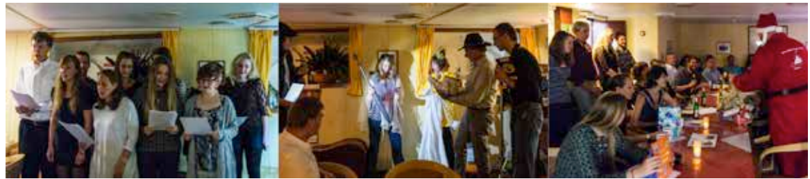
Christmas Party in the Messe of METEOR