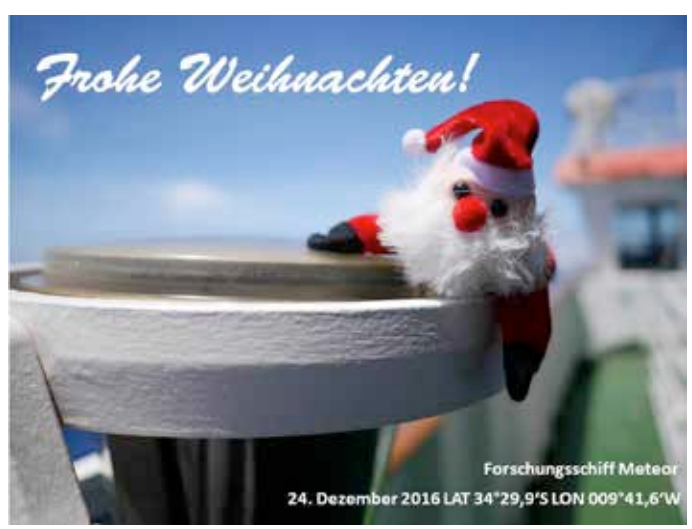
Christmas season is noticable in the Southern hemisphere on METEOR

Christmas at sea: For most of us it was a very special to experience the Holiday Season far away from our close friends and family together with the METEOR crew. All around the vessel people were busy in their spare time preparing. The mess was seasonally decorated. Two Christmas trees were put up. The daily menu was decorated and printed on nice paper. Der