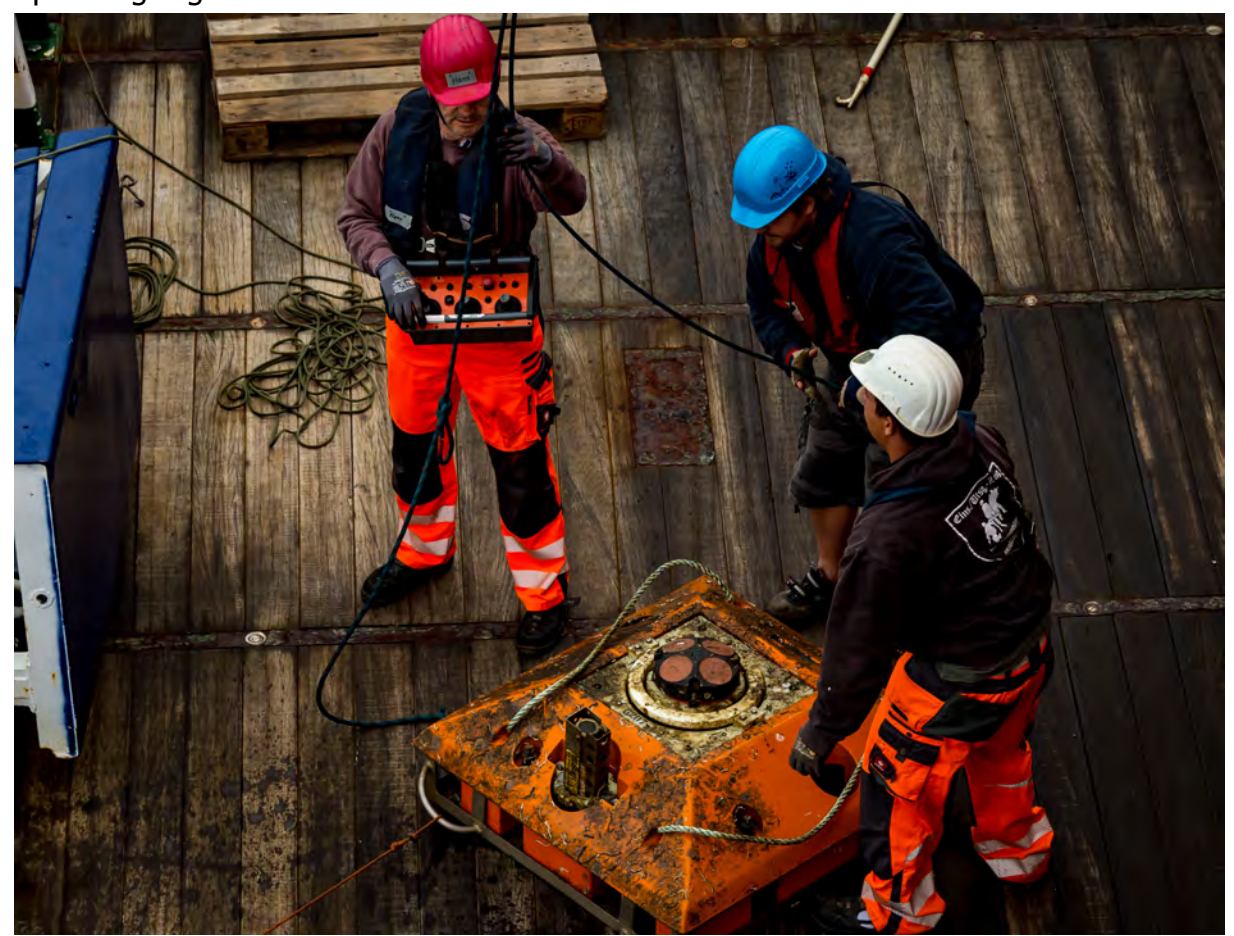
Fig. 2: Successful recovery of the IOW bottom shield equipped with an ADCP on the shelf off Namibia at 18°S.

The following program of M131 includes hydrographic cross-shelf sections off Namibia at 18°S, 20°S and 23°S. Besides CTD and microstructure measurements as well as sediment grab and dredge sampling, we serviced several moorings on these sections. Up to now, we were able to successfully recover the IOW bottom shields at the shelf at 18°S and 20°S (Fig. 2). The mooring work of our cruise will be accomplished shortly before reaching Walvis Bay, the final destination of METEOR cruise M131. The moorings on the shelf off Namibia are, amongst others, equipped with acoustic Doppler current profilers. These instruments measure time series of the full-depth velocity, thereby allowing to follow signals in the along-shore flow that might propagate along the southwest African coast from the equator as far south as Walvis Bay. Associated changes in water mass properties, like temperature, nutrients and/or oxygen directly affect the biological productivity in the eastern boundary upwelling region.