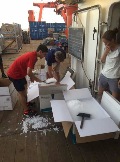
Wrapping up the samples for transport back to Germany