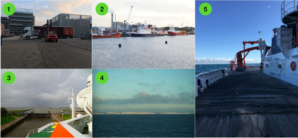
1: Logistics at GEOMAR, 2: RV Meteor in port, 3: Passing the lock in Emden; 4: the English coast, 5: the free deck and endless horizon