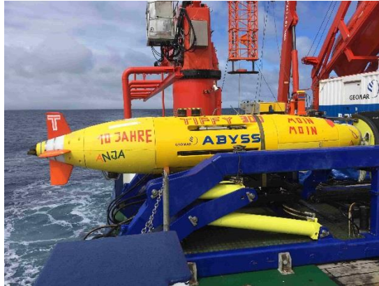
"Tiffy" loaded into the launching system and ready for her 300 th dive

We also were able to celebrate a milestone event on Friday – the 300 th dive of the AUV (or "Tiffy" as she is affectionately known to all on board). The team decorated the vehicle nicely for this event and sent her off for another successful dive. Since GEOMAR acquired the AUV in 2008 with the help of funding from the DFG, it has spent 3.500 hours underwater and traversed over 18.000 km of seafloor, making it one of the most successful vehicles of its type anywhere in the world. Its longest ever dive occurred on this cruise, with a record 137km "flown" in one 24-hour dive. A cruise of the type we are performing would be almost impossible to achieve without such a vehicle.