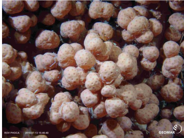
A large variety of creatures call this soft coral fan their home, as this close-up photograph taken in 700m water depth shows.

We also were able to celebrate a milestone event on Friday – the 300 th dive of the AUV (or "Tiffy" as she is affectionately known to all on board). The team decorated the vehicle nicely for this event and sent her off for another successful dive. Since GEOMAR acquired the AUV in 2008 with the help of funding from the DFG, it has spent 3.500 hours underwater and traversed over 18.000 km of seafloor, making it one of the most successful vehicles of its type anywhere in the world. Its longest ever dive occurred on this cruise, with a record 137km "flown" in one 24-hour dive. A cruise of the type we are performing would be almost impossible to achieve without such a vehicle.