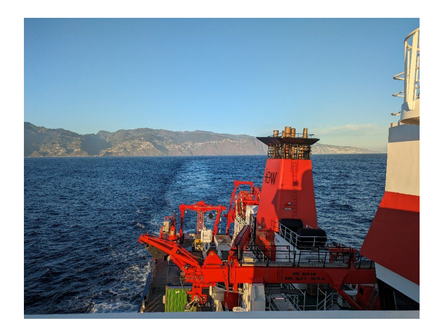
Figure 2 Operating in the leeward protection of Madeira has been an essential factor in the success of MSM126 operations in the reporting period. The picture was taken on Feb. 18, 2024, with winds of 7 Bft and 3 m groundswell plus windswell on the exposed island sides, but ideal conditions on the protected South side of the island.