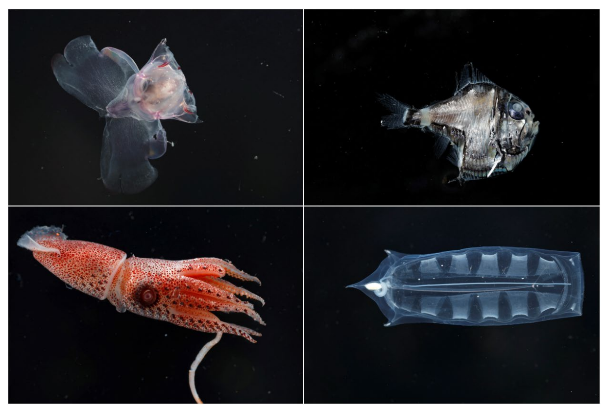
Figure 3 Four members of the "midwater world" around Madeira caught during plankton sampling with the IKMT plankton net and the ROV pelagic samplers on stations RID_D1 and CAN_D1. Clockwise from top left: pteropod Diacavolinia, Hatchet fish, juvenile squid Histioteuthis, leptocephalus eel larva..