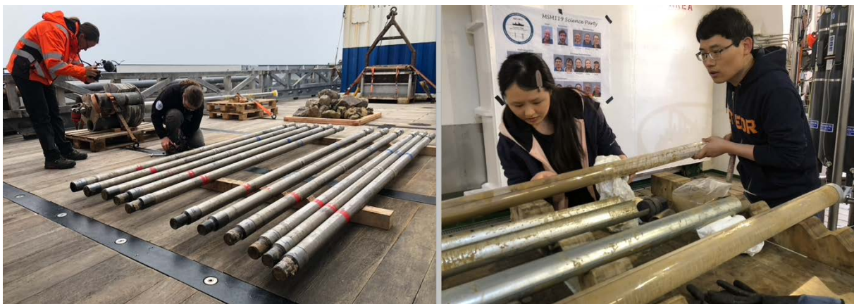
Figure 1 Left: Inner core barrels from the second, more than 25m deep MeBo-hole, which also underwent downhole logging. Right: The core recovery spanned from the seafloor through Squid Pond to the crust.

Our second drilling with MeBo aimed to completely core the sediments of the Squid Pond near the spreading axis, to take in-situ temperature measurements at intervals of about 5 meters, and then to log the complete sediment sequence with an acoustic borehole tool. The borehole reached into the oceanic crust and cored very solid, cemented sandstones at the transition to the sediment filling, which were probably formed by precipitated solutions from the upper crust. The next boreholes then aim for deeper penetration into the basalts.