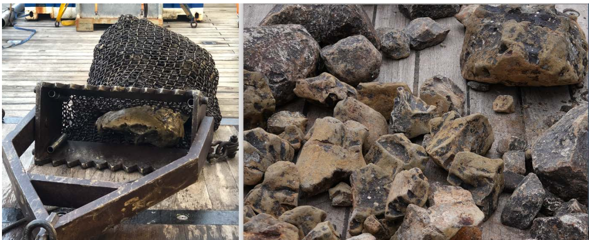
Figure 2 Left: Recovered dredge, which had been deployed close to the ridge axis in a hostile environment without benthic fauna. Right: Numerous basalt clasts with different porosity and degree of alteration await their scientific description.

The periods between the MeBo missions are used to connect the spreading axis with the Squid Pond with a transect of heavy corers and temperature measurements and to better characterize the ridge flank processes. In the considered time slice of the earth's history, i.e. the last 3 million years, we see thermal variability in the data, differently consolidated and altered sediments, variable pore water compositions, and different proportions of magmatic components. However, only analyzes in the home laboratories will allow conclusions to be drawn as to the extent to which this material comes from the dorsal axis or, for example, from Iceland. In order to trace different magma compositions or changes in the rock-physical properties of the oceanic crustal basalts, complementary short dredge trains are run parallel to crustal age isolines (Fig. 2). Initial response shows that fresh or superficially altered basalts are dominant, and more rarely blistered varieties are found. Occasionally, other lithologies were found and are interpreted to represent glacial dropstones.