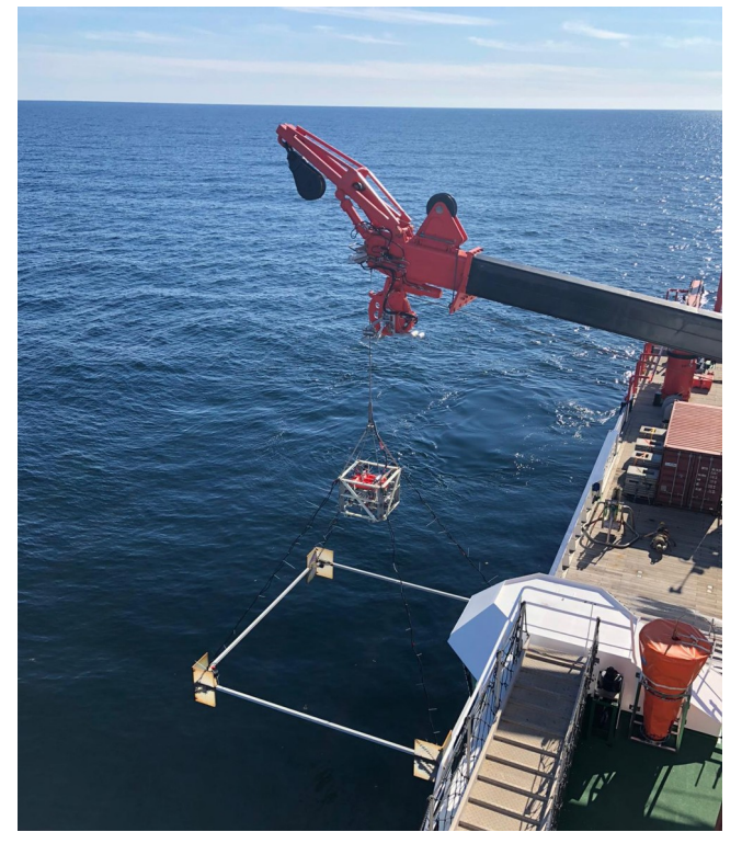
Fig. 1: CSEM transmitter in "CAGEM" configuration.

In the first half of last week (October 4<sup>th</sup> - 7<sup>th</sup>) we carried out our first successful CSEM (controlled source electromagnetic) measurements. After our bottom-towed system was damaged during a first attempt in the previous week (see last weekly report), this time we used our transmitter in the "CAGEM" configuration (see Fig. 1). In this configuration the pressure tubes with the transmitter electronics are mounted in a small frame above the actual transmitter antenna. The antenna itself consists of a 6.3m x 6.3m frame with metal grates attached to each corner, which serve as transmitter electrodes. Diagonally opposite transmitter electrodes are used as dipoles, so with this arrangement it is possible to carry out measurements with two horizontal dipoles that are perpendicular to one another. The transmitted signals are recorded with the previously deployed stationary OBEM receivers. Compared to the bottom-towed