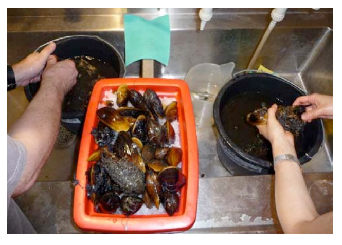
Fig. 4: Processing of the collected Bathymodiolus mussels in the deck lab of the MS Merian

Mussels were collected for analyses of their symbiotic bacteria (Fig. 3 and 4) and hot fluids from the Irina II structure were sampled for chemical and microbiological analyses. The in situ mass spectrometer measurements of the hot smoker fluids (as high as 350°C) showed that these are highly enriched in hydrogen, methane, CO<sub>2</sub>, sulfide and other reduced compounds.