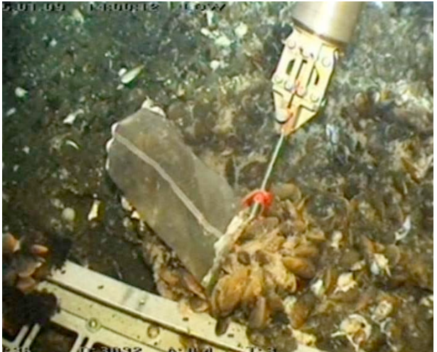
Fig. 3: Images from our ROV dive at the Logatchev hydrothermal vent field. On the left, the recovery of the OBP and on the right, the sampling of Bathymodiolus mussels near the active vent site Irina II.

Mussels were collected for analyses of their symbiotic bacteria (Fig. 3 and 4) and hot fluids from the Irina II structure were sampled for chemical and microbiological analyses. The in situ mass spectrometer measurements of the hot smoker fluids (as high as 350°C) showed that these are highly enriched in hydrogen, methane, CO<sub>2</sub>, sulfide and other reduced compounds.