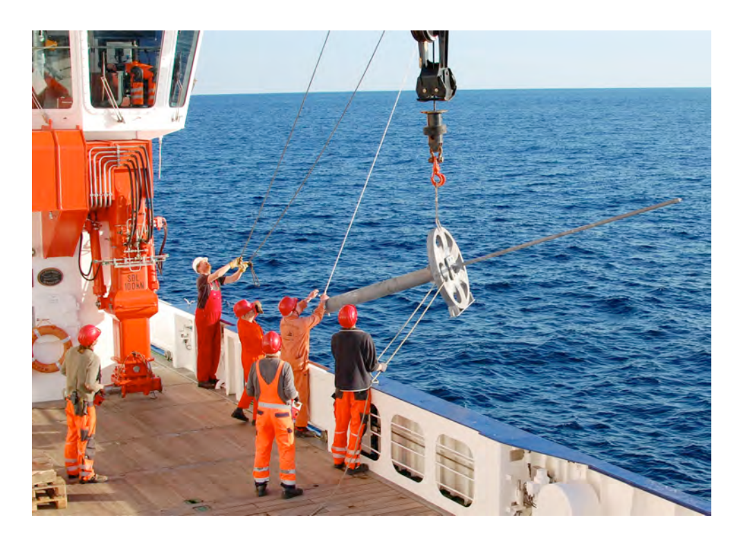
Fig. 2: Deployment of the pressure and pore water sampling lance.