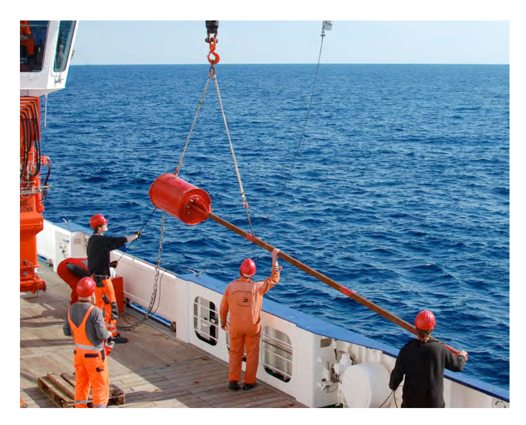
Fig. 1: Deployment of the temperature lance.