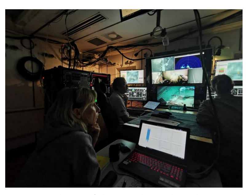
Figure 3: Control center of the ROV with two pilots and two scientists collected along the ROV route. accompanying the dive. During the dive, which lasts about 6 hours in total, they This was followed with a work in shifts.

ended at 1010 m water depth. The focus was to investigate the deep-water benthic communities. Different to other oceans, these deep-water communities are sparse and mostly consist of sponges and rare and tiny solitary corals. Here we were able to observe and sample pioneer fauna on the submarine lava flows. Subsequently, the depth range was sampled using van Veen grabs on the slope of the volcano.