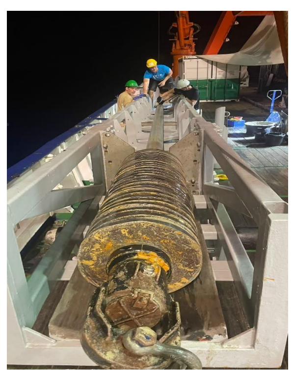
Figure 2: Preparation of the 18 m gravity core, comprised of three 6 m segments.

After the seismic survey, the Mabahiss Deep was approached. The infill of this 2200 m deep basin, is dominated by mass wasting deposits. However, based on the seismic and parasound profiles, we were able to identify a well stratified area within the basin, where we retrieved a full 6 m gravity core on deck at 20:24 LT on September 26. We then decided to extend the core barrel to 18 m (Fig. 2). The barrel penetrated nearly 16 m into the sediment but had only about 12 m of core recovery. We suspect that a dense sediment layer at the head of the tube blocked further sediment entry into the liner. After sediment sampling was completed, hydroacoustics were run until the next morning to close existing gaps in the bathymetry. On 27th September after running a CTD in the Mahabiss Deep the next ROV dive commenced at 09:36 LT, The target of the ROV deployment was the flank of a submarine volcano located at the NW edge of the basin. The dive started at 1360 m and