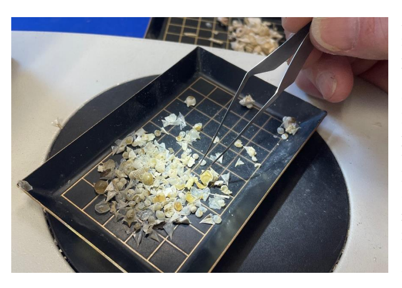
Figure 4:. Typical coarse fraction of deep-marine samples sourced by planktic organisms: pteropod shells dominate

mesophotic benthic fauna. The observations were substantiated by Van Veen grab samples which were collected along the ROV route and on the shallow plateau. These samples represent the fauna of the deep mesophotic zone based on them containing rhodoliths, gorgonian corals, and photosymbiotic large benthic foraminifers.